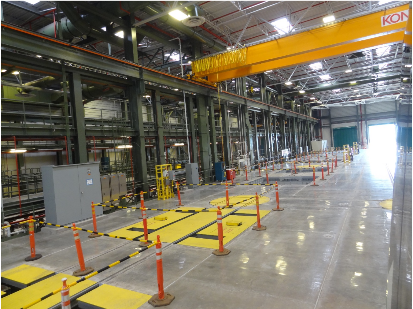
Rail Operations Center 2015