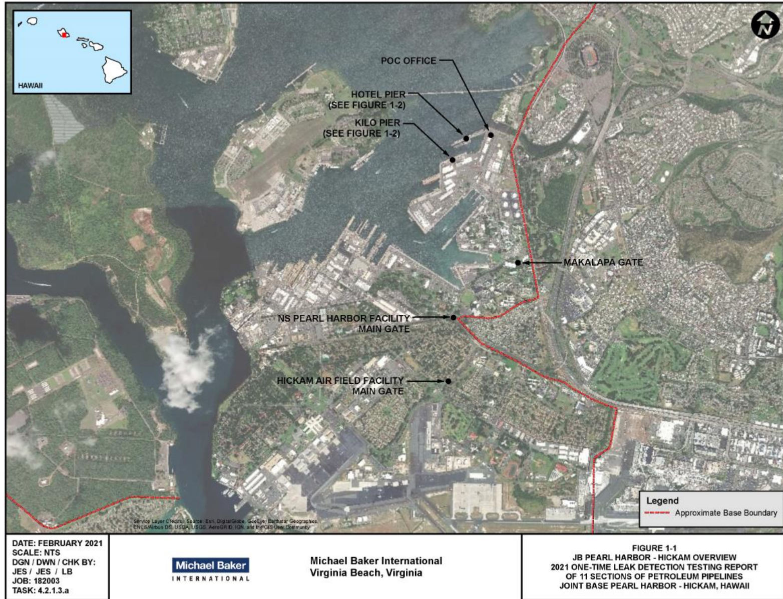
Figure 1-1: JB Pearl Harbor-Hickam Overview