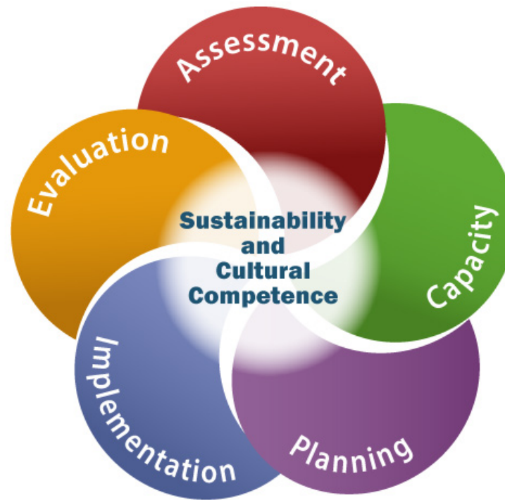
Figure 1: SPF Program Model

The purpose of Hawai'i's Strategic Planning Framework – Partnership for Success (SPF-PFS) Project is to improve the quality of life for residents of Hawai'i by continuing to implement the five steps of SAMHSA's SPF process. A goal of the SPF process aims to aid in the development of more effective prevention strategies and sustainable prevention infrastructures statewide to reduce and prevent underage drinking. The five steps included in the SPF process are as follows: 1) Assess Needs 2) Build Capacity 3) Plan 4) Implement and 5) Evaluate. These five steps are informed and made relevant by sustainability and cultural competency considerations throughout the project (Figure 1).