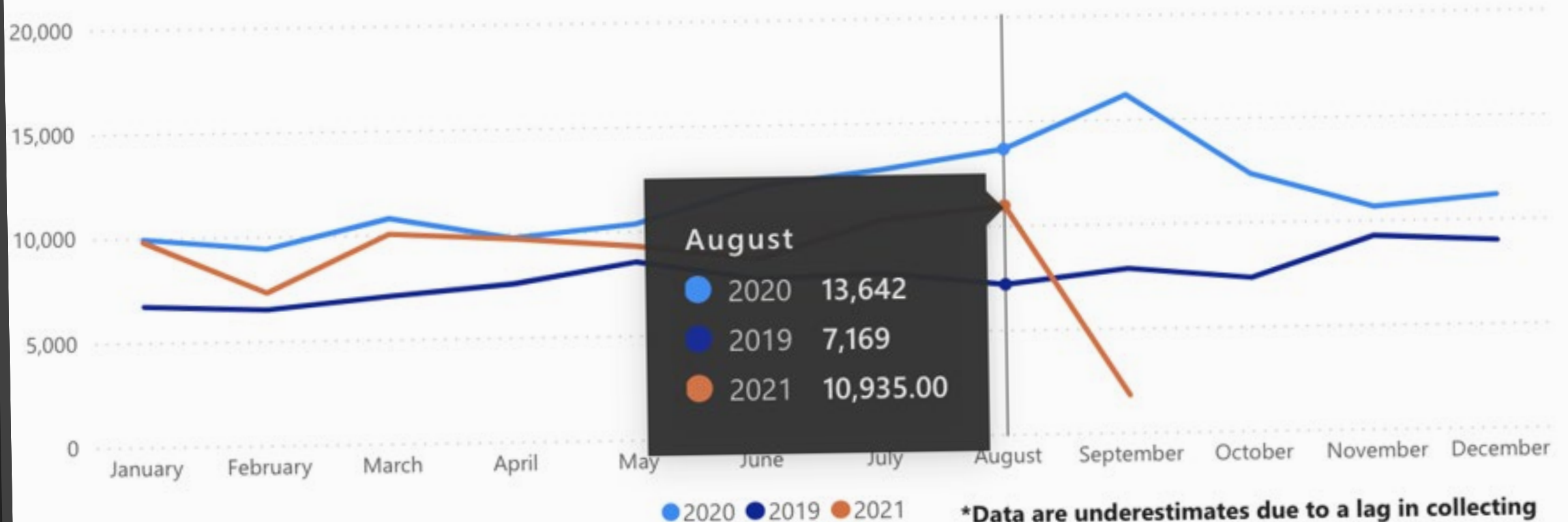
All Hawaii CARES Calls Monthly for 2021*, 2020 and 2019

*Data are underestimates due to a lag in collecting Substance Use Disorder line call volumes.