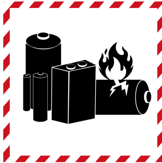
Image 1: Lithium-ion battery shipping label used for packages containing Lithium-ion batteries. Diagram of batteries in the middle and red border with white hatch marks around the label.

(Note: This list is not exhaustive; check labels on devices to see if they contain lithium-ion batteries. Additionally, this information and list do not apply to large format lithium-ion batteries like ones contained in electric vehicles and photovoltaic solar panel systems.)