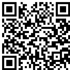
DOH Solid & Hazardous Waste Branch