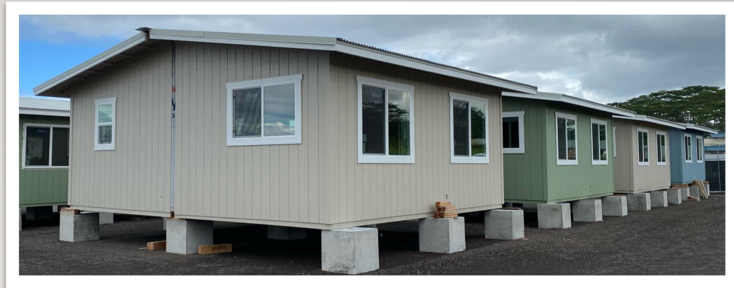
Coming Soon: New Affordable Housing development project