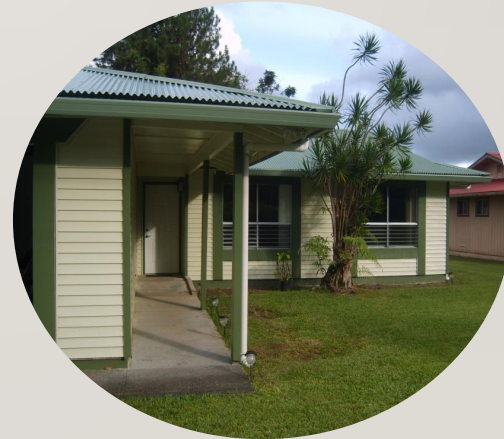
Wilder House, Hilo