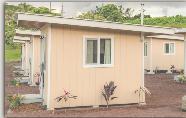
Sacred Heart Community, Pahoia