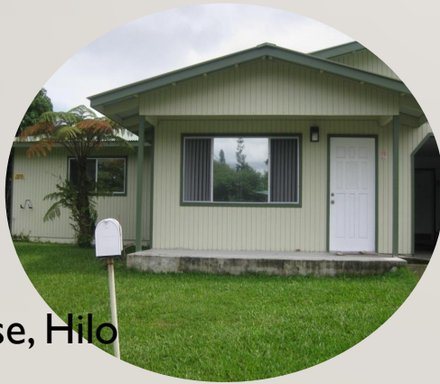
Kuleana House, Hilo