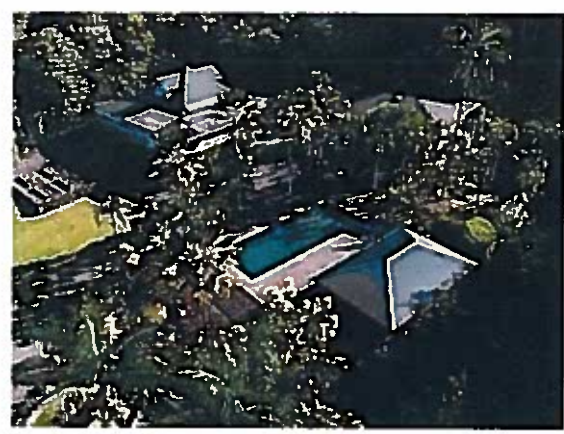
Figure 1 – Bird's eye view of Property

73-4617 Kaloko Halia Pl. Kailua Kona, HI 96740