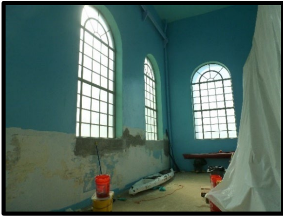
▲ Repainting at the Kalihi Pump Station

LOAN AMOUNT: $ 20,000,000.00 PRINCIPAL FORGIVENESS: $ 4,890,864.74 (24.45%) AMOUNT DISBURSED IN SFY 2024: $ 7,820,250.25 ISLANDWIDE SERVICE POPULATION: 986,999