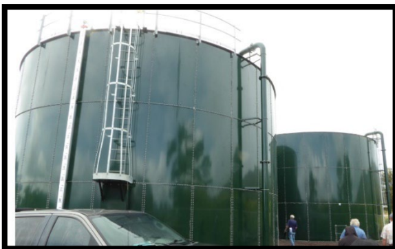
▲ New 228k-gallon steel tanks

LOAN AMOUNT: $ 1,621,805.00 PRINCIPAL FORGIVENESS: $ 1,621,805.00 (100.0%) AMOUNT DISBURSED IN SFY 2022: $ 527,417.37 PUBLIC WATER SYSTEM (PWS) 303 SERVICE POPULATION: 650