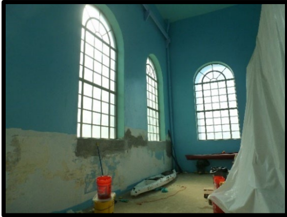
↗ Repainting at the Kalihi Pump Station