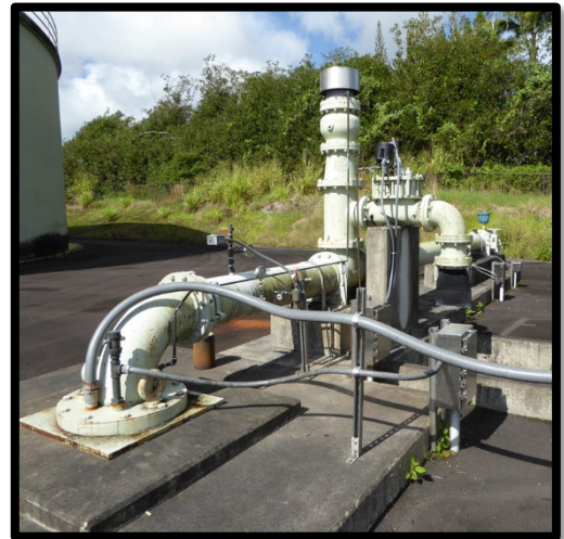
▲ Olaa #6 Deepwell (pre-construction)

Project Description: Programmatic Financing loan for water system improvements on the Island of Hawaii. Sub-projects included, multiple deepwell repair projects islandwide (Hualalai, Piihonua #1 Well C, Honokohau, Pana'ewa Well A, Holualoa, Keahuolu, Olaa #6, and Parker #1); Kaieie Mauka Facility Improvements; Kahaluu Shaft Inclined Lift Replacement; Puako Waterline Replacement; and Waikoloa Reservoir No. 1 Earthquake Damage Repairs.