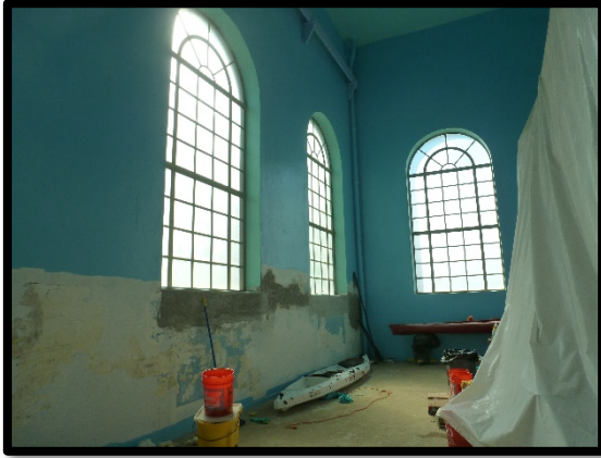
▲ Repainting at the Kalihi Pump Station