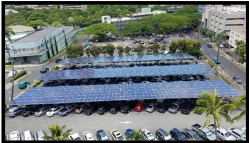
▲ PV panels installed in the parking lot of the Beretania Station