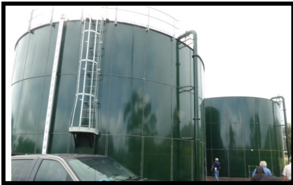
▲ New 228k-gallon steel tanks

LOAN AMOUNT: $ 1,621,805.00 PRINCIPAL FORGIVENESS: $ 1,621,805.00 (100.0%) AMOUNT DISBURSED IN SFY 2021: $ 938,323.45 PUBLIC WATER SYSTEM (PWS) 303 SERVICE POPULATION: 650