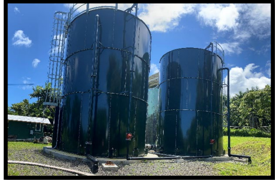
▲ New 50,000-gallon tanks

Project Description: Decommission old 50,000-gallon water tank and construct two replacement 50,000-gallon water tanks to protect public health and update aging infrastructure.