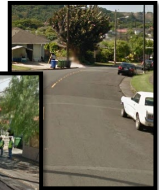
▲ Kauai Street