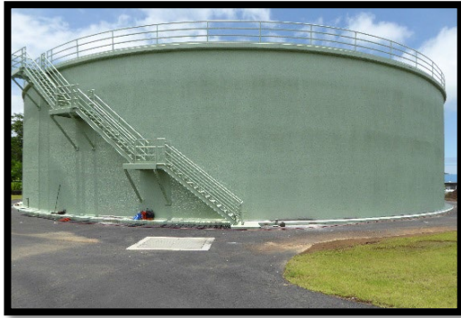
▲ New 2.0 MG tank