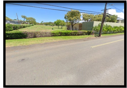
▲ 22nd St + Puu Panini St intersection

Project Description: Install mains and appurtenances along 22nd Avenue from Kilauea Avenue to Diamond Head Road, along Diamond Head Road from 22nd Avenue to Kahala Avenue, and along Kulamanu Street from Kahala Avenue to Kulamanu Place, approximately 5,235 linear feet. Install 8-inch mains and appurtenances along Kulamanu Place from Kulamanu Street to end, along Malapua Place from 22nd Avenue to end, along Ulupua Place from 22nd Avenue to end, along Huanui Street from 22nd Avenue to Huanui Place, along Kaalawai Place from Diamond Head Road to easement, and along Kuine Place from Kulamanu Street to end, approximately 2,270 linear feet.