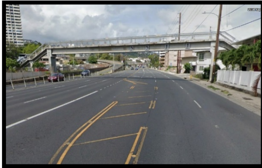
▲ Kapiolani + Puu Panini St intersection