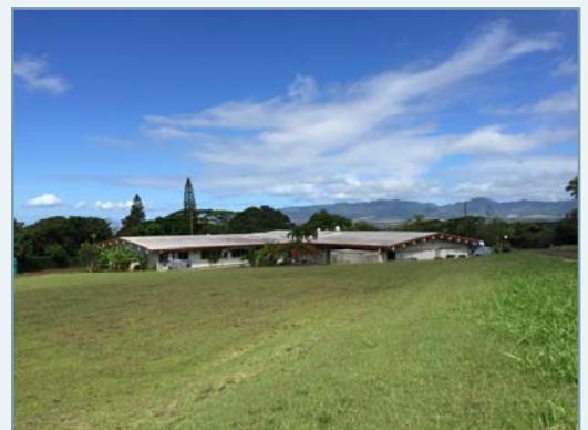
Beautiful view from our new home

We expect to be at our new location by August 1st. However, it would be best to call or email us for the latest update if you're coming to visit us at our office. There may be a short period of time that we will be unavailable as we pack and unpack, but all of our systems (e.g., SDWIS Viewer, SCRS, SATS, etc.) will remain online throughout the move. Only the SDWB and Hazard Evaluation and Emergency Response Office will be moving in August. The remaining DOH environmental offices/branches anticipate moving to their new offices further up the hill by the end of the year or early 2018.