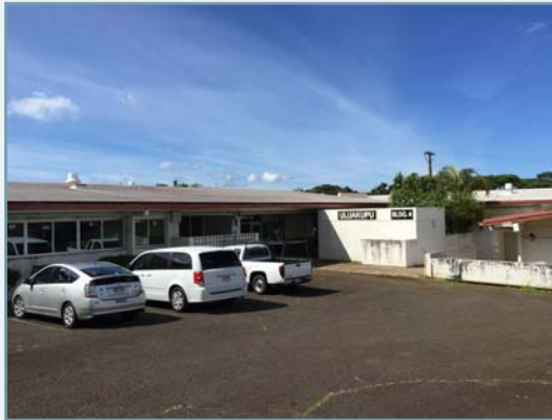
SDWB's new office, Uluakupu, on Waimano Ridge

Since 1994, the AAFES Building in Kakaako was the home of the Safe Drinking Water Branch (SDWB). On August 1, 2017, the SDWB will move our office to Waimano Ridge into Uluakupu Building 4. Uluakupu means to develop or grow. Waimano Ridge should be familiar to many of you as it has been the home to State Laboratories Division for more than 20 years.