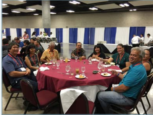
Kauai, Maui, Lanai, and Molokai managers and operators have lunch with SDWB members.

The Fourth Annual Pacific Water Conference was held at the Hawaii Convention Center on February 14-16, 2017 with the theme “Preserving Our Living Water Resources.”