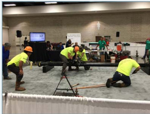
The HBWS Pipe Tapping team gets to work to try and repeat.