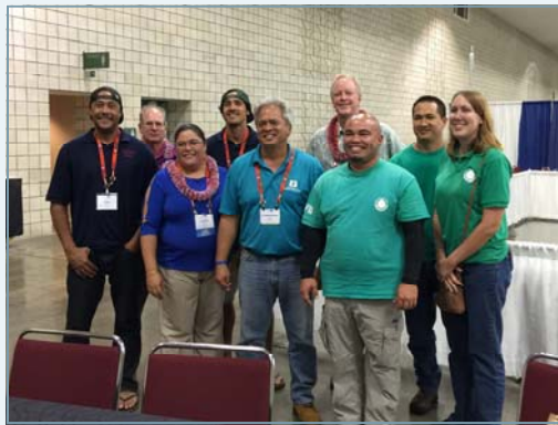
HBWS, Team Kawela, and the judges pose after an impromptu Top Ops match including the Judges.

Continuing its support of small water systems again this year, the SDWB sponsored the registration of 46 eligible system personnel and operators. Attendance at both the pre-conference and conference was sponsored.