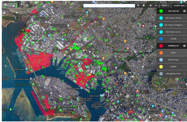
iHEER viewer with site centroids (green dots) and EHMP/IC Boundaries (red fields)

After Public Record document migration from the previous system, iHEER development focused on the site viewer, grouping, and labeling sites for specific categories. For better site identification site centroids and site boundaries were separated into different layers. Additional layers were added to be able to track site controls such as site-specific EHMPs, Areawide EHMPs, and temporary Construction EHMPs. For internal management, a layer was added to include site-specific features. Site with controls and sites without controls can also be separately viewed.