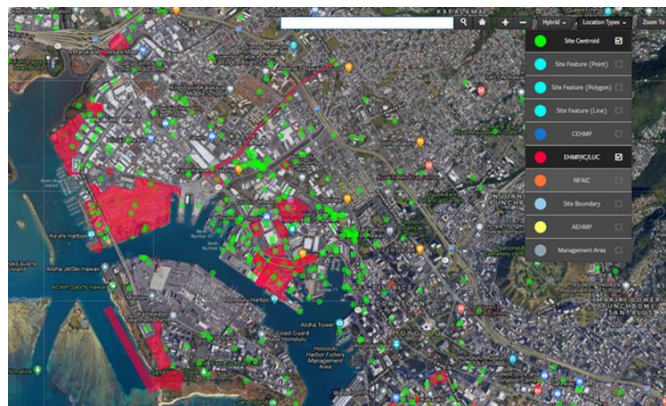
iHEER viewer with site centroids (green dots) and EHMP/IC Boundaries (red fields)

iHEER is the HEER Office's site management and document repository system. SDAR sites can be located on a map-based viewer by the public, site information viewed, and many documents directly downloaded. Some restrictions on site viewability and document download apply due to site security or ongoing investigations. iHEER can be accessed via the following link: https://eha-cloud.doh.hawaii.gov/iheer#!/home