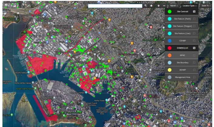
iHEER viewer with site centroids (green dots) and EHMP/IC Boundaries (red fields)

located on a map-based viewer by the public, site information viewed, and many documents directly downloaded. Some restrictions on site viewability and document download apply due to site security or ongoing investigations. iHEER can be accessed via the following link: https://eha-cloud.doh.hawaii.gov/iheer#!/home