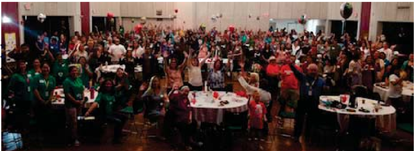
SPIN Conference goes celebrated a moment of togetherness at lunch.