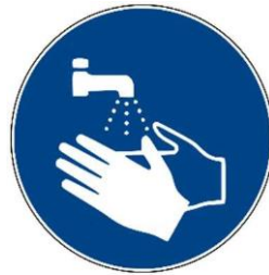
Maluk nag paey