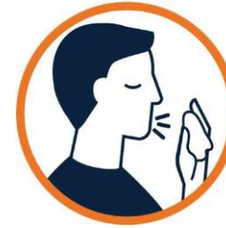
Upnguy e chochol