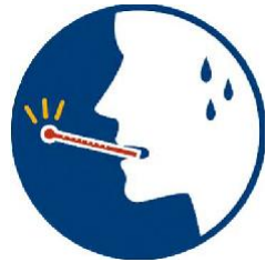
Gawel u Dakeney