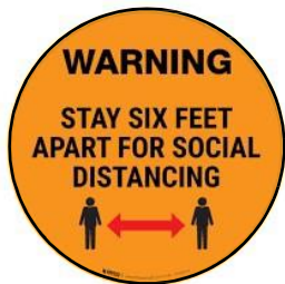
Dehr nohn keieng ekei