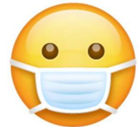
Doadoahngki men permas

Ong mengihtik de ire me pid COVID-19: Eker nempe 2-1-1