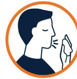
Perehla Ahmw Kopokop