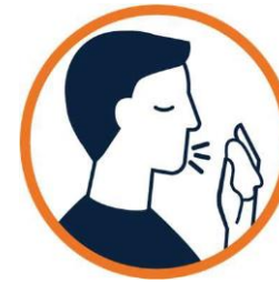
Pwonu Omw Mor