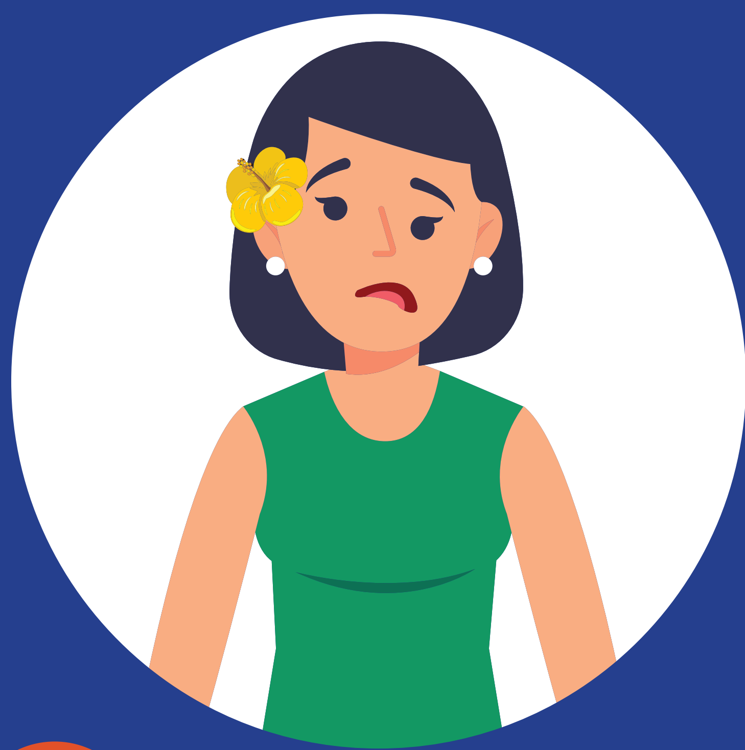
F ace Drooping