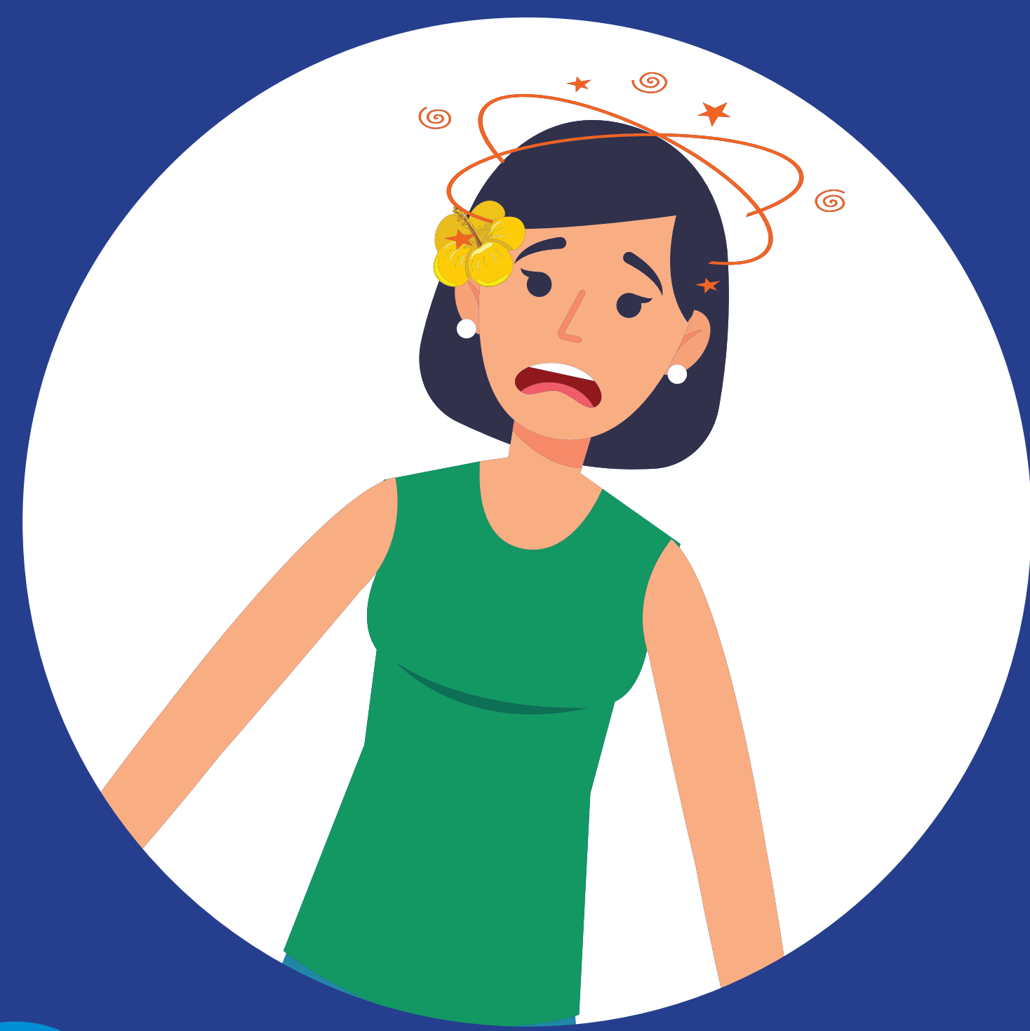
B alance Loss