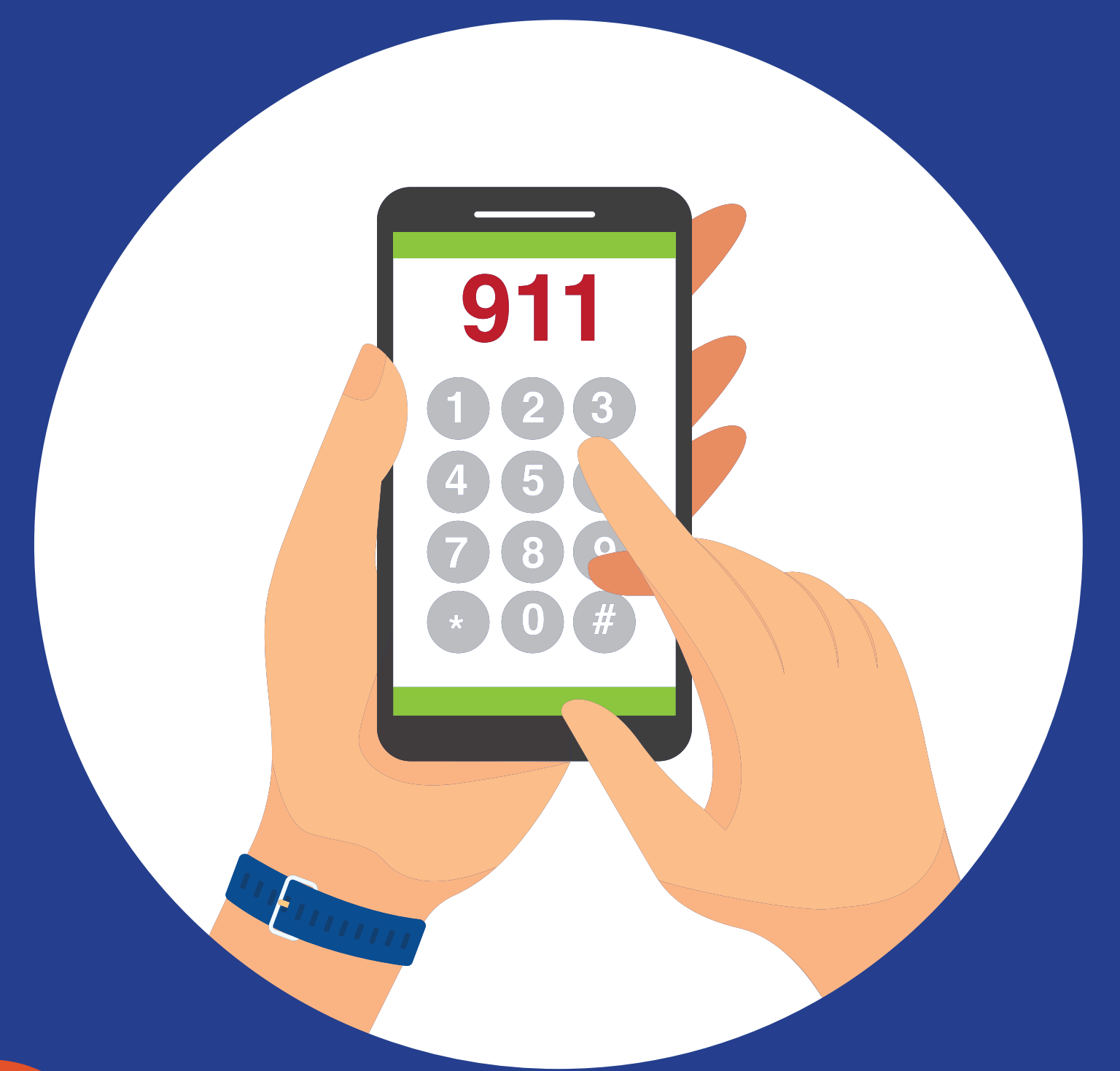
T ime to call 9-1-1