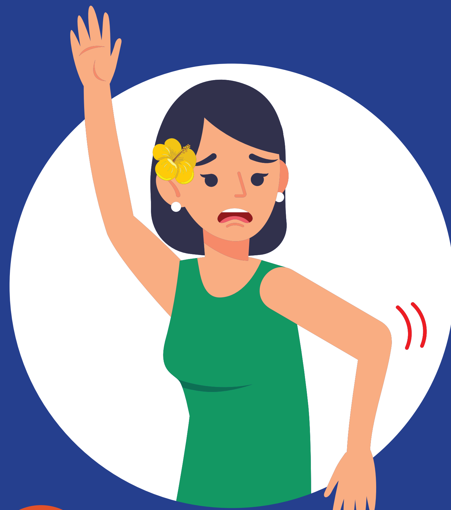
A rm Weakness