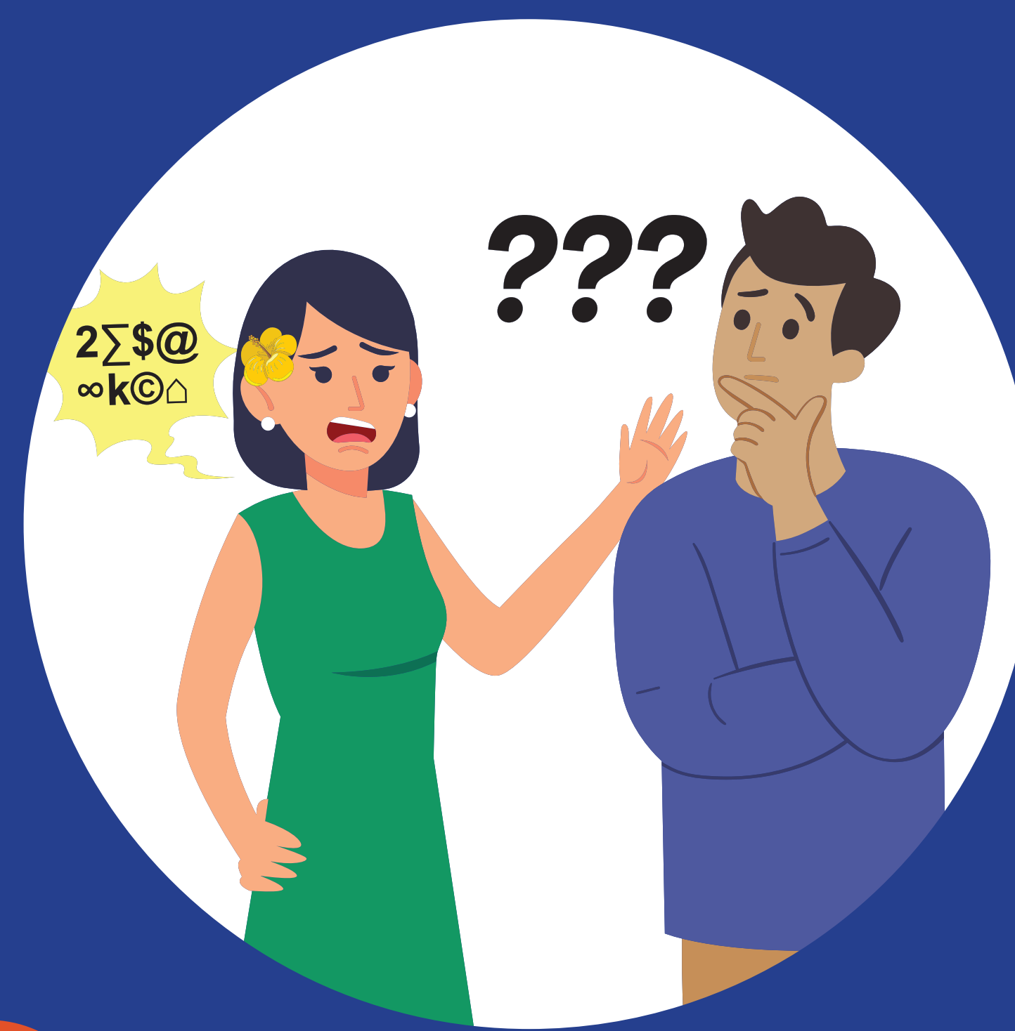
S peech Difficulty