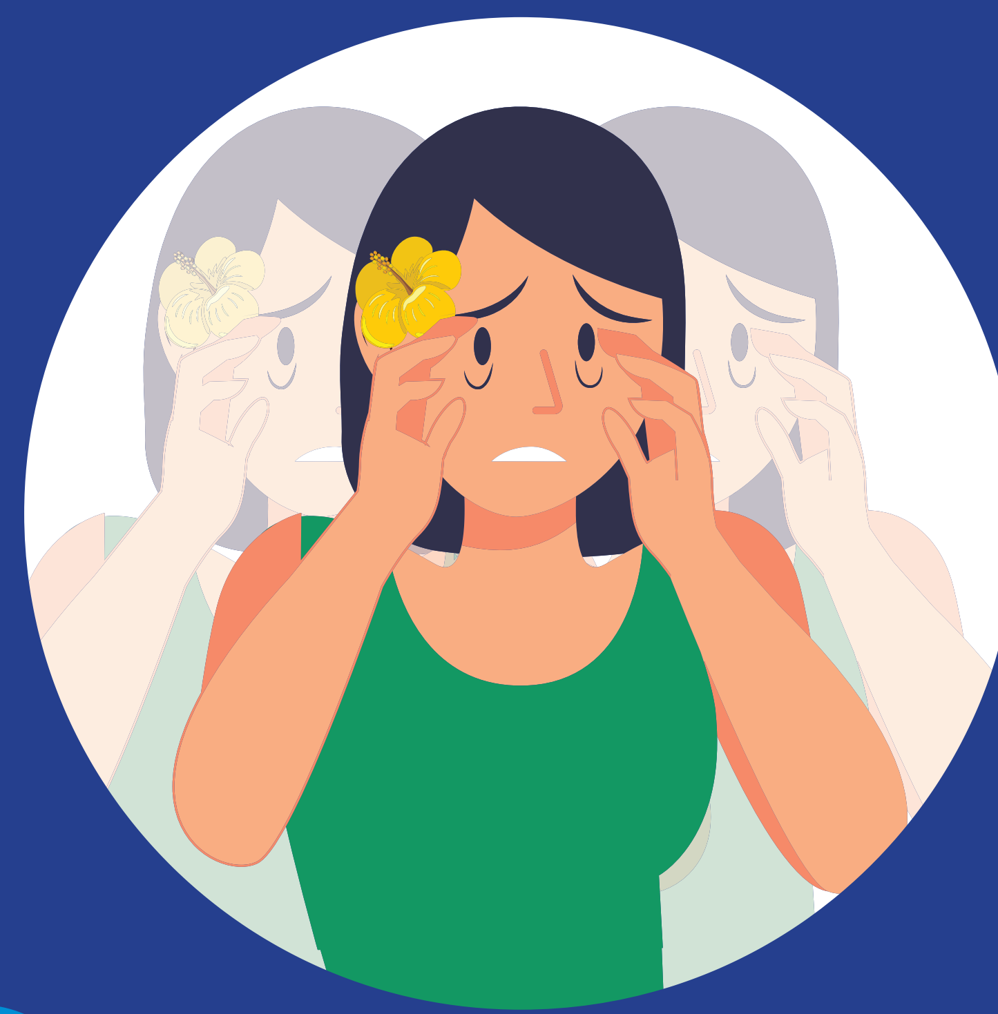
E yesight Problems