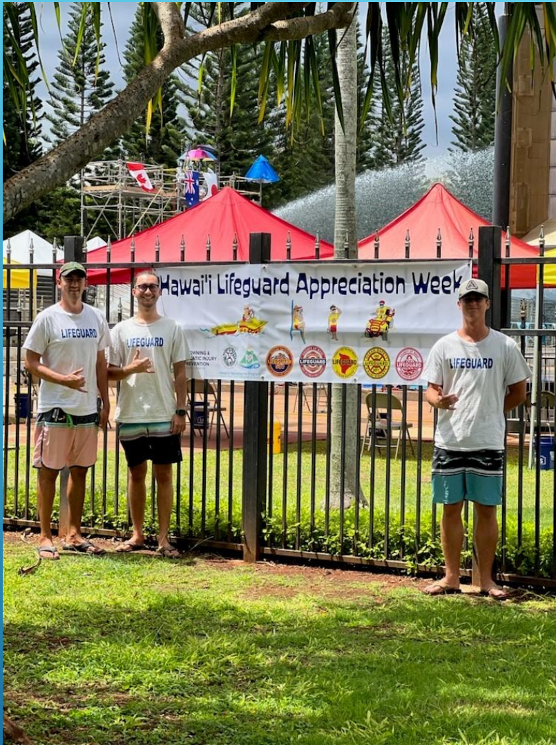
Honolulu County Parks and Recreation Lifeguards at the K. Mark Takai Veteran's Memorial Aquatic Center on Oahu