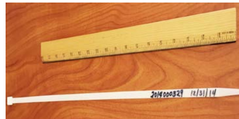
1/4" x 24" Cable Ties

WARNING: Untagged cannabis plants or improperly tagged cannabis plants (not meeting the above requirements) are subject to confiscation and removal by law enforcement, and the grower or property owner is not guaranteed the protections available in chapter 329, Hawaii Revised Statutes.