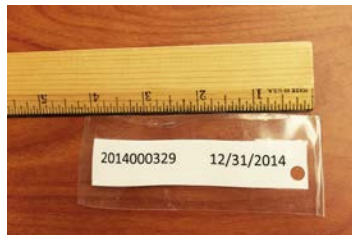
Waterproof Gorilla Tape (folded with solid color insert)