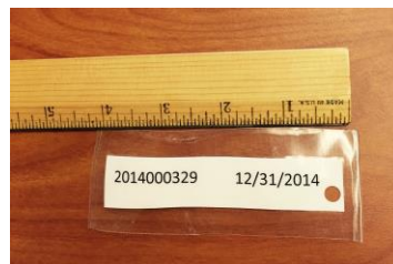
Waterproof Gorilla Tape (folded with solid color insert)