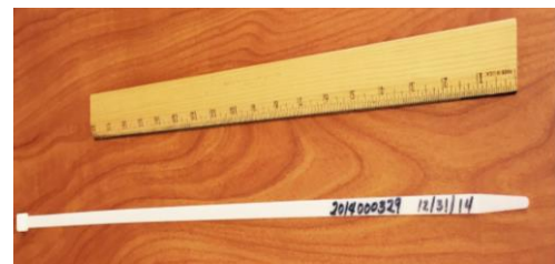
1/4” x 24” Cable Ties

WARNING: Untagged marijuana plants or improperly tagged marijuana plants (not meeting the above requirements) are subject to confiscation and removal by law enforcement, and the grower or property owner is not guaranteed the protections available in chapter 329, Hawaii Revised Statutes.