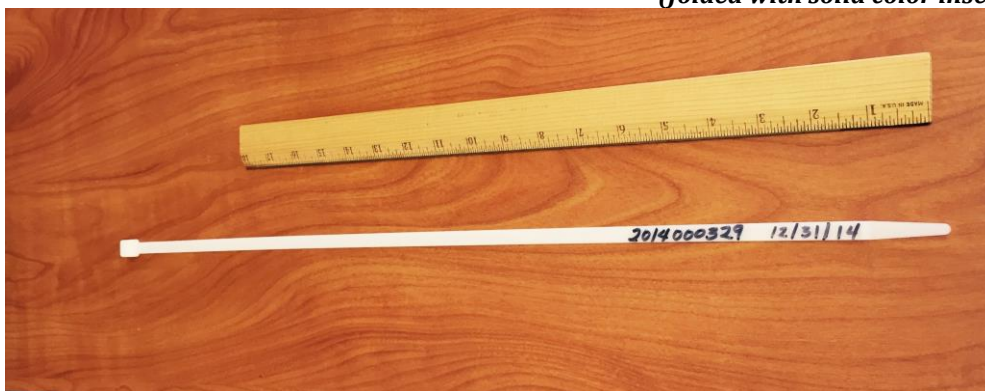
1/4” x 24” Cable Ties

WARNING: Untagged marijuana plants or improperly tagged marijuana plants (not meeting the above requirements) are subject to confiscation and removal by law enforcement, and the grower or property owner is not guaranteed the protections available in chapter 329, Hawaii Revised Statutes.