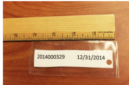
Waterproof Gorilla Tape (folded with solid color insert)