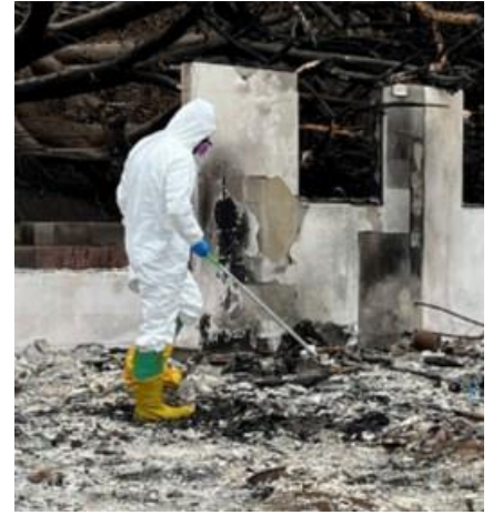
Mwet orekma luhni DOH oracni kuhtuh apact fin acn Kula.

Apact inge orekeni ke September 21 liki lohmi alkosr ma fihrihyak e Kula. Lohmi inge muhsaiyucklac ke yac 1930 nuhke 2000 kuhtuh. Ke srihpen lohmi inge ma fihrihyak Lāhainā oreklac ke puhluhn pacl sefanna, ohfohs luhni Hawai'i Department luhni Health (DOH) luhlahlfongi lah ac oasr kain in ma pwacsin kuh fohfohk ke apact fin acn Lāhainā pac.