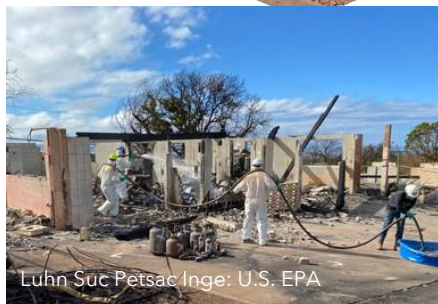
Luhn Suc Petsac Inge: U.S. EPA