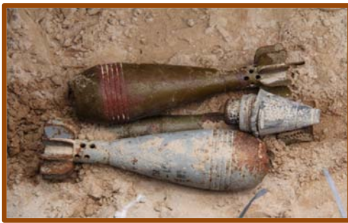
Examples of Unexploded Ordnance (UXO) found at Waikoloa Maneuver Area

available online at https://health.hawaii.gov/heer/files/2019/11/WMAAEHMP.pdf