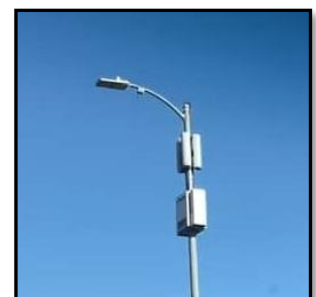
5G cellular antenna on a street light.