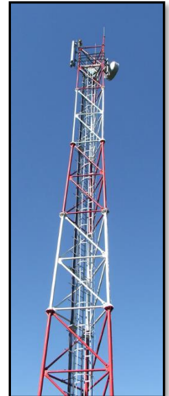
3G cellular tower

5G networks use a higher frequency than 3G or 4G networks and are planned to be much faster and more reliable. The higher frequency uses shorter RF energy waves called millimeter waves. These millimeter waves are weaker than 3G or 4G at traveling long distances and cannot easily move through walls, buildings, and other physical obstacles. Because of this, to complete the 5G network and keep cell service strong and fast, many small antennae are required to provide adequate cellular coverage in an area. These antennae will likely be placed on homes, buildings, and other structures. It is expected that the addition of these 5G antennae will increase the environmental exposure to RF energy. However, these increased exposures are likely to be less than from your personal cell phone and RF energy levels are projected to generally stay below limits set by the Federal Communications Commission (FCC). This increased exposure to RF energy from 5G networks is not expected to cause direct health effects. More research is needed to further our understanding of the effects of 5G networks.