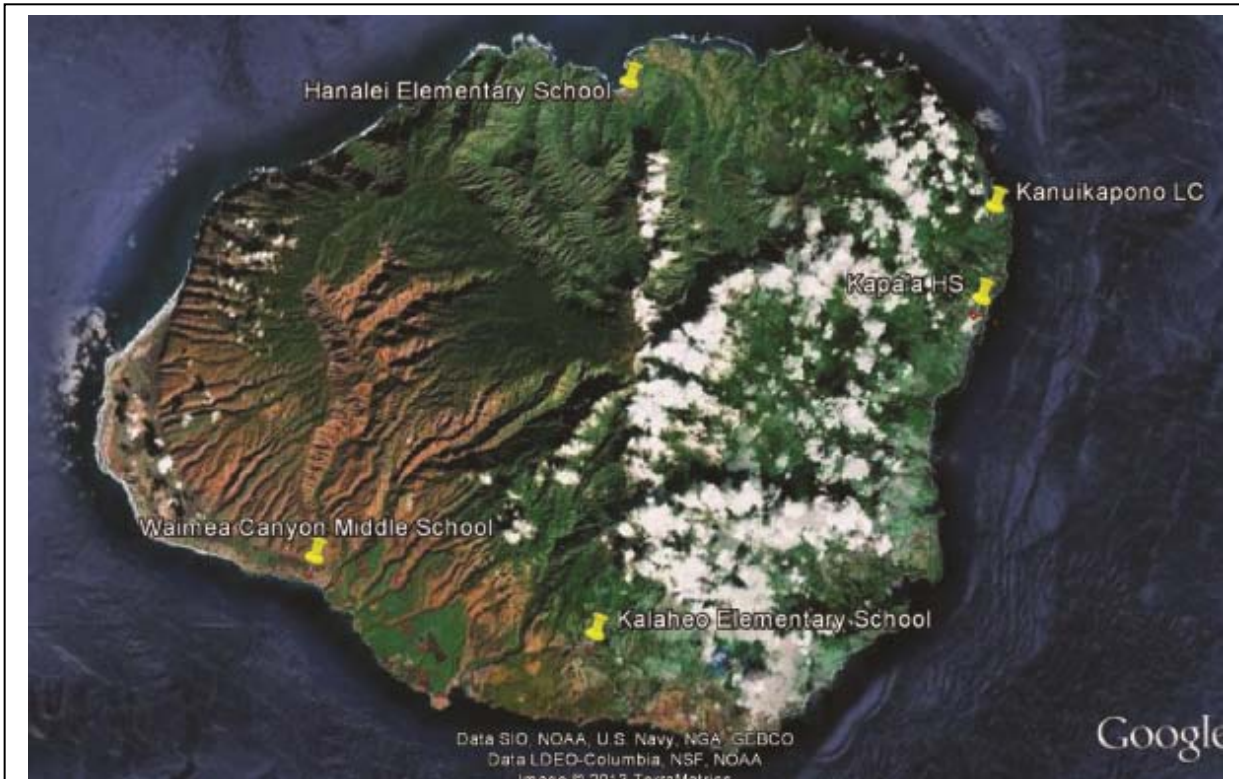
Figure 3. Map of air sampling sites on Kauai Waimea Canyon Middle School Kalaheo Elementary School Hanalei Elementary School Kanuikapono Learning Center Kapaa High School