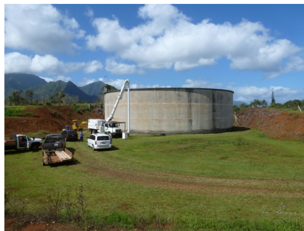
Princeville Water Supply Contamination