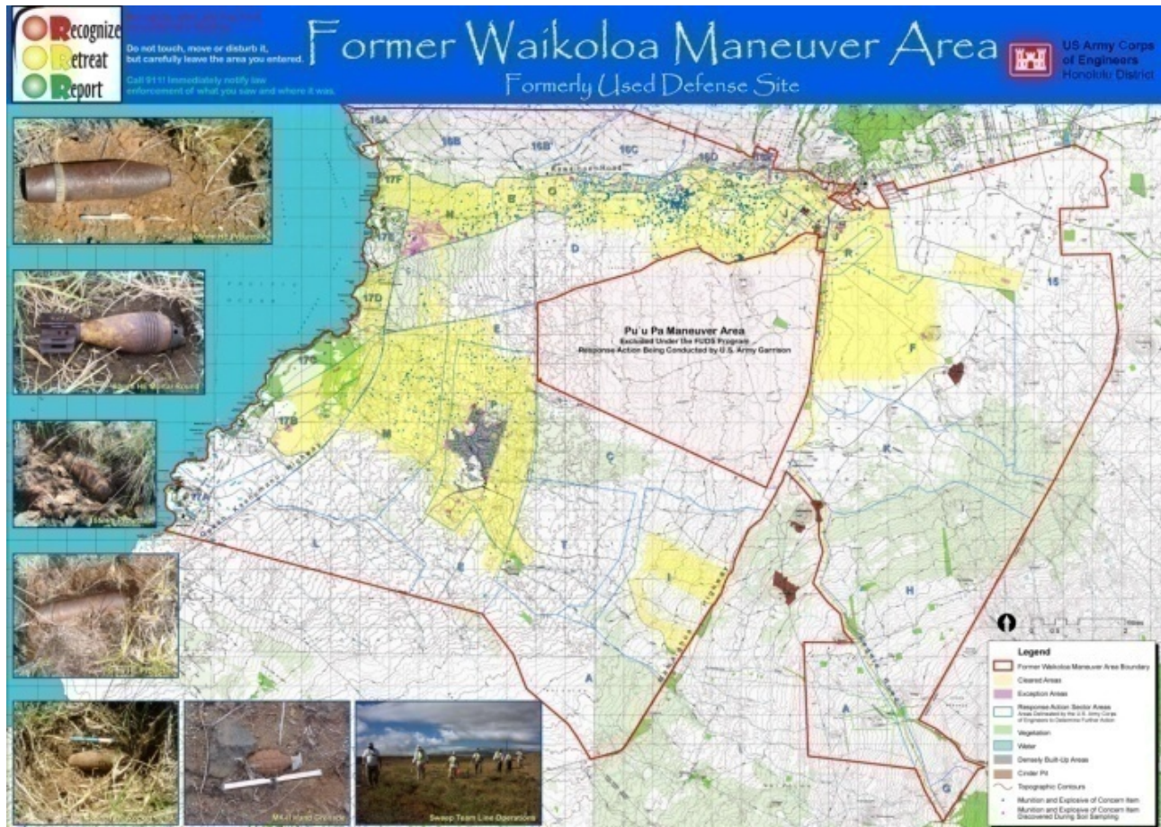
Waikoloa Maneuver Area Site

The HEER Office also works closely with DLNR and other agencies that have properties affected by UXO. In 2012, after extensive facilitated negotiations and careful oversight, the Corps completed the UXO assessment at Ahihi Kinau, a fragile and unique marine anchiline ecosystem on Maui, requiring special care during the munitions investigation to avoid disruption of its unique environment.