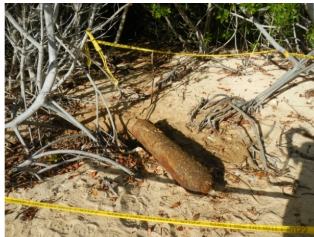
Alan Davis Beach Abandoned Cylinder

Case No 20130309-1500: Oil spilled from a transformer on March 9, 2013 when the Kahuku Wind Farm was undergoing clean-up response actions resulting from the August 1, 2012 fire and was not operational. During an oil transfer from a transformer to a transfer tank, approximately 100 gallons of FR3 vegetable oil released onto a gravel pad. Absorbent pads were used to contain the spill. Oil-impacted gravel and soil was excavated, and disposed of at PVT Landfill.