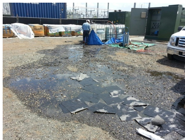
Kahuku Wind Farm Oil Spill