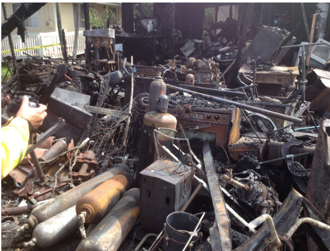
Kahuku Residence Fire Damage