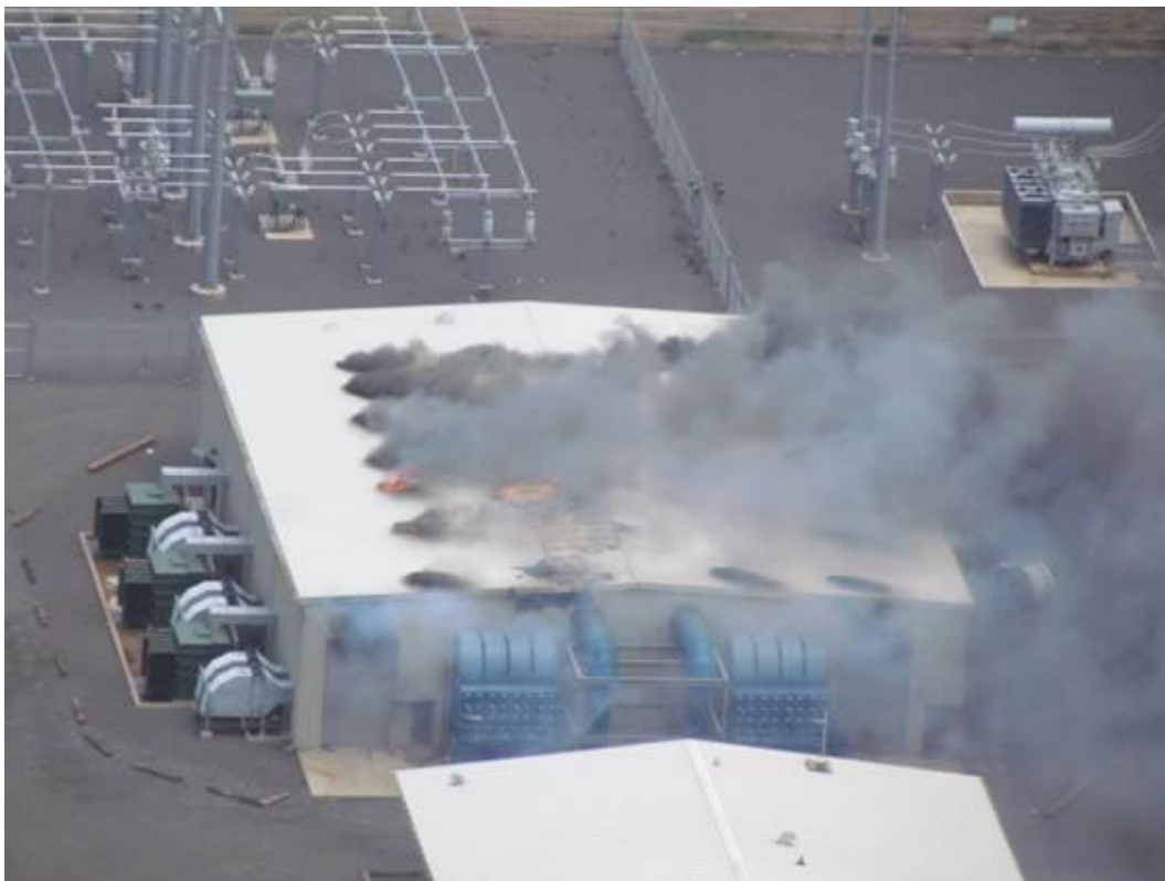
Kahuku Wind Farm Structural Fire