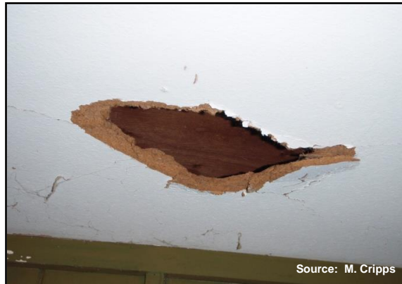
A canec panel that is broken. Note the characteristic fibrous texture and brownish color.