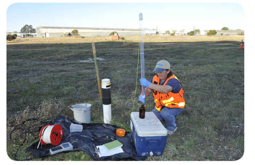
Monitoring natural attenuation at the site by collecting a groundwater sample.

MNA is selected when any contaminant source has been removed and only low concentrations of contaminants remain in soil or groundwater. The anticipated cleanup time for MNA must be reasonable compared to that of other more active cleanup methods. MNA requires less equipment and labor than most methods, which decreases cleanup costs. However, the cost of many years of monitoring can be high. MNA has been selected or is being used at over 100 Superfund sites across the country.