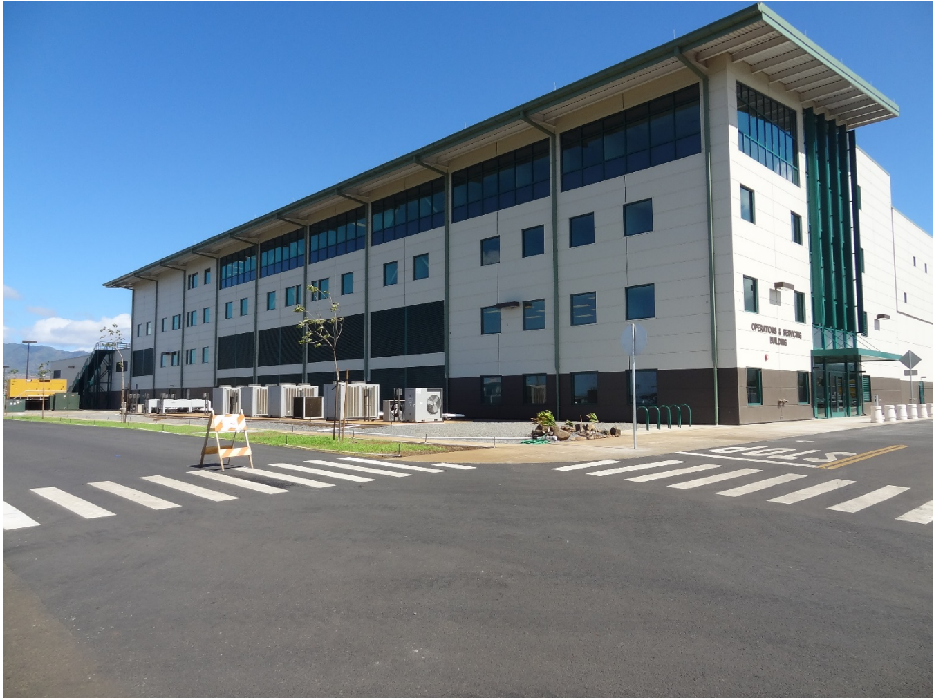
Rail Operations Center 2015

The HEER Office presentation also displayed the interactive map the public can access to find information about contamination along the rail corridor. The map was created last year and embedded on the HEER website.