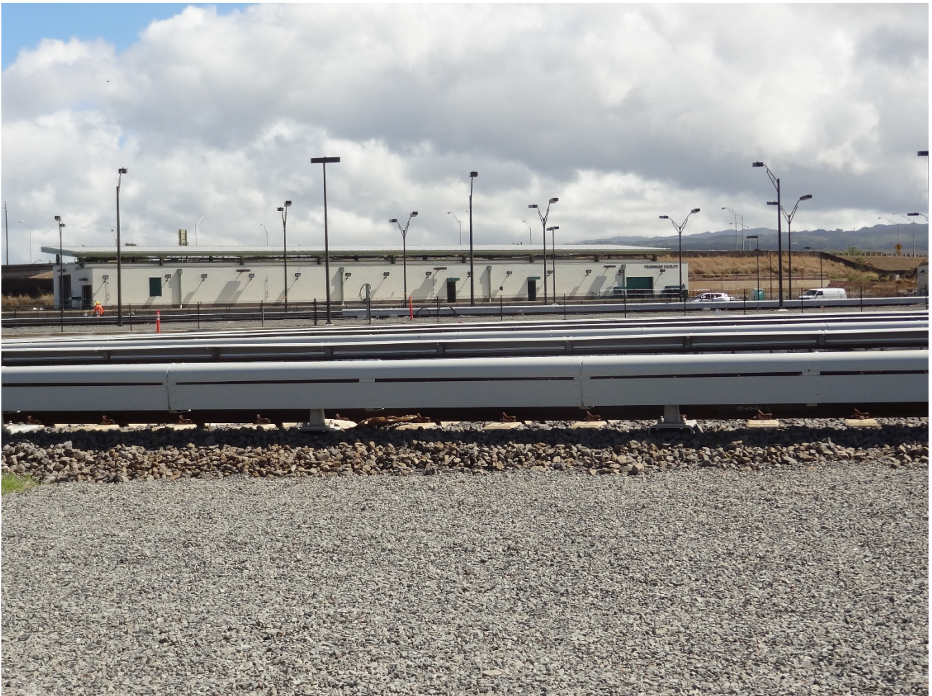
Rail Operations Center 2015