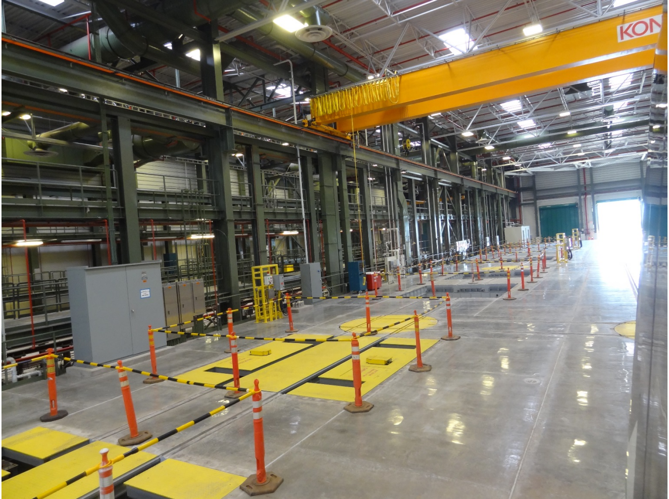
Rail Operations Center 2015