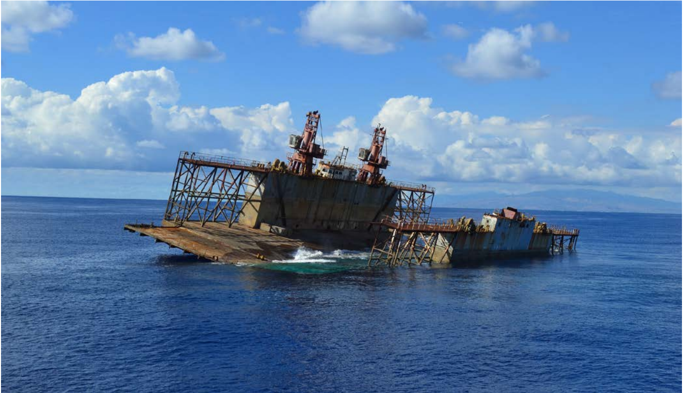
Incident Case No.: 20160203-1326 Dry Dock Disposal An abandoned floating dry dock disposed of by State DOT at sea.