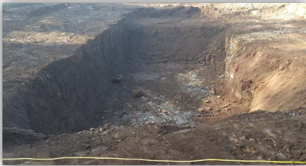
Above: Limits of Excavation in Deep Contaminated Area, April 2016

After gathering and addressing public input on a proposed remedy for the contaminated soils, the HEER Office approved a final cleanup action plan for the pesticide storage/mixing site located near Hawi town. The approved cleanup plan called for excavation of all contaminated soils above relevant DOH environmental action levels and disposal at the West Hawaii sanitary landfill. A detailed work implementation plan was approved by the HEER Office in June 2015, and 2,685 tons of contaminated soil was removed from the site and placed in the West Hawaii landfill by May 2016. This site received brownfield funding for the initial soil investigation, and HICDC utilized a substantial loan from the Hawaii Brownfield Revolving Loan Fund to complete the soil removal action.