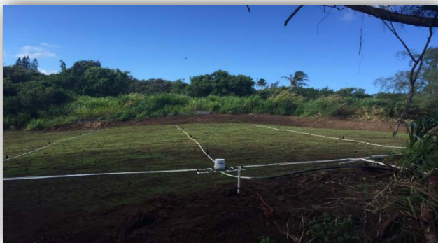
Above: Grass Stabilizing the Final Restored Site, June 2016

The excavated site was filled with clean soil and restored with a grass cover by June 2016. HICDC will receive a "No Further Action" letter from the HEER Office for closure, and the site will be suitable for future unrestricted use, including residential development.