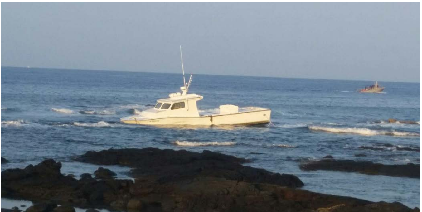
Incident Case No.: 20160122-1937 F/V Hoku Kea

A 39-foot vessel ran into reef. No hazardous substances released. A contractor was hired to remove 500-plus gallons of diesel, 1 gallon of lubricating oil, and seven batteries from the boat. The boat was salvaged and disposed of.