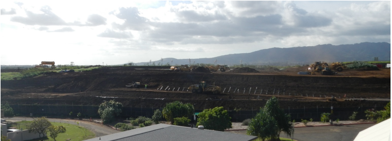
Amazing Transition – Rail Operations Center at the Former Ewa Junction Fuel Drumming Facility under Construction in 2013