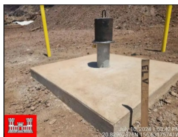
Figure 3. Groundwater monitoring well MW-02.

Samples are collected and analyzed quarterly (every 3 months, see Table 4), which is a typical frequency for waste storage and disposal facilities.