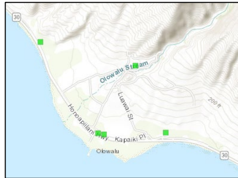
Figure 1. Locations of air monitors near Olowalu.

The locations of the PurpleAir monitors operated by DOH are found in Figure 1. Monitoring data can be viewed at DOH's Maui Data Portal .