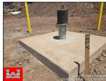
Figure 3. Groundwater monitoring well MW-02.