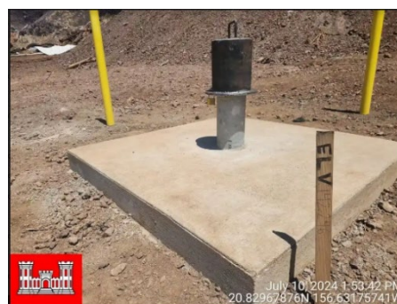
Figure 3. Groundwater monitoring well MW-02.

The first samples were collected on July 7, 2024. Samples will continue to be collected and analyzed quarterly (every 3 months), which is a typical frequency for waste storage and disposal facilities. These first samples are considered ‘baseline’ samples, since MW-01 and MW-02 are newly installed, and there are no previous sampling data from them to compare. The analysis performed includes the analytes and parameters found in Table 4, which includes contaminants or indicators of contaminants present in the TDS leachate (see Section 1, Table 2).