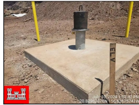
Figure 3. Groundwater monitoring well.

The first samples were collected on July 7, 2024. Samples will continue to be collected and analyzed quarterly (every 3 months), which is a typical frequency for waste storage and disposal facilities. These first samples are considered ‘baseline’ samples, since MW-01 and MW-02 are newly installed, and there are no previous sampling data from them to compare. The analysis performed includes the analytes and parameters found in Table 4, which includes contaminants or indicators of contaminants present in the TDS leachate (see Section 1, Table 2).