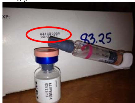
Rotarix ® lot numbers (fourth character differs on the outer carton, vial, and oral applicator).