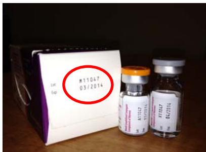
Menveo ® lot numbers (outer carton lot begins with "M," vials begin with "A" and "X").