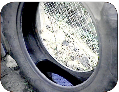
Recycle used tires or keep them protected from rain.