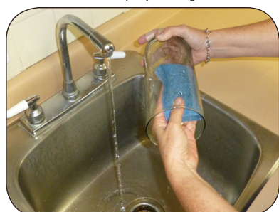
Weekly, scrub vases & containers to remove mosquito eggs.