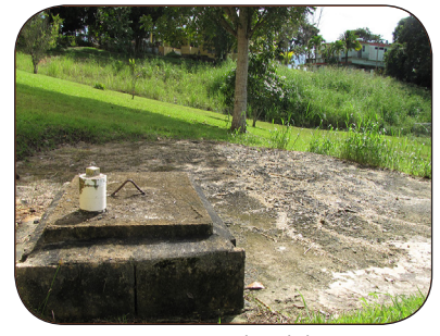
Keep septic tanks sealed.