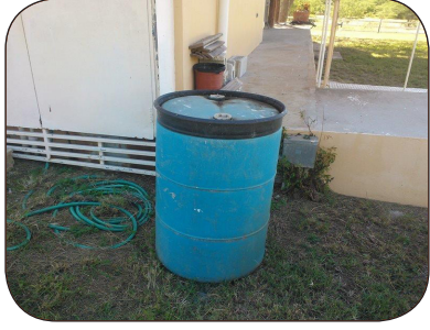
Keep rain barrels covered tightly