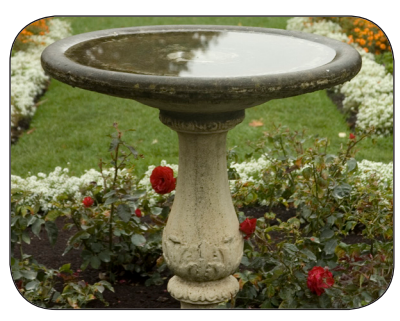
Weekly, empty standing water from fountains and bird baths