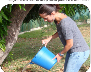
Drain & dump any standing water.