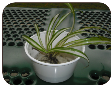
Put plants in soil, not in water.