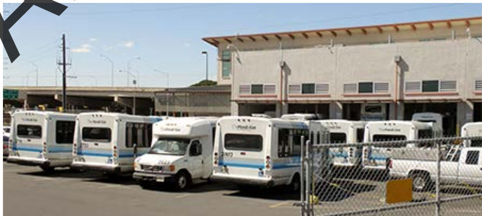
The Handi-Van base and maintenance yard on Middle Street has an estimated capacity to handle between 185-195 paratransit vehicles. The facility is nearing capacity with the current fleet of 181 Handi-Vans, with no room to expand.

If DTS decides to increase the fleet, parking and maintaining the vehicles would be a challenge. In the past, DTS and OTS solved increased demand requirements by hiring more drivers and buying more vans. The existing facilities lack the capacity to handle many more vehicles. The cost of a West Oahu facility for both TheBus and Handi-Van fleet would cost $144 million and take at least five years to construct.