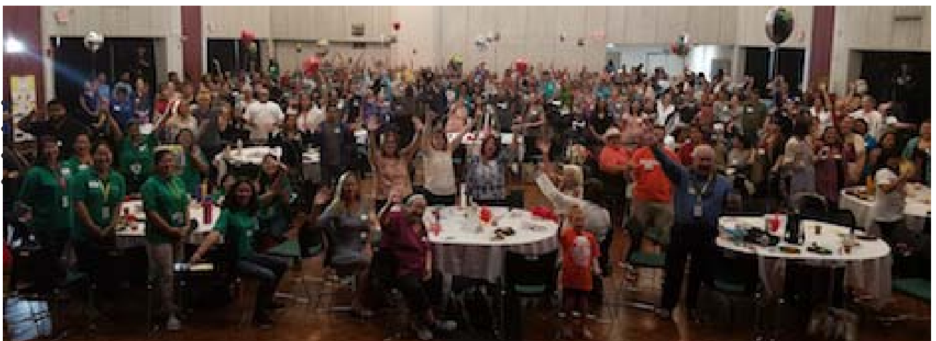
SPIN Conference goers celebrated a moment of togetherness at lunch.