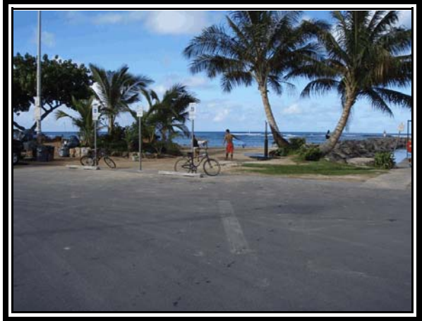
Rock Piles (Offshore) 000415