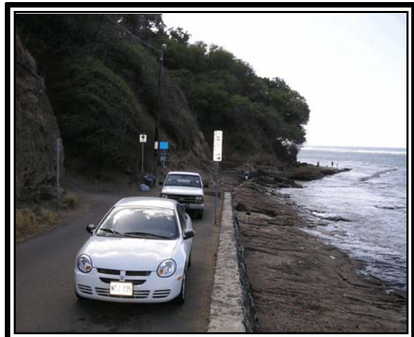
Diamond Head Beach 000217