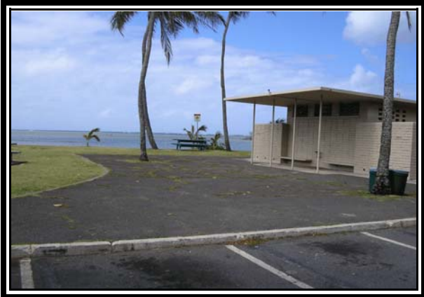
Kuliouou Beach Park 000202