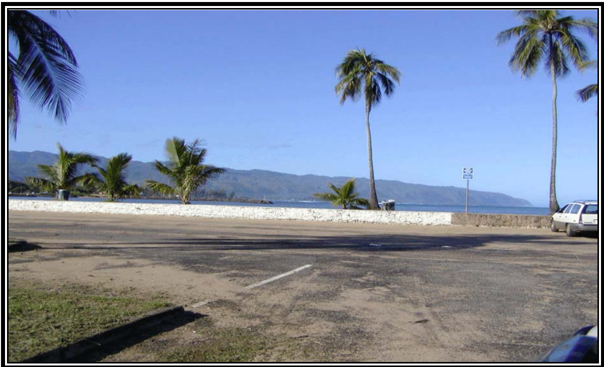
Haleiwa Beach Park 000171