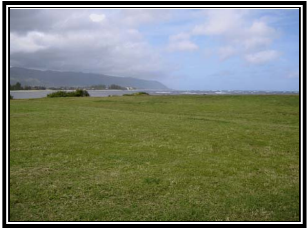
Kaiaka Bay Shoreline 000170