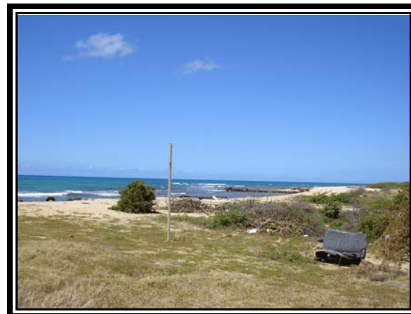
Sand Island Pt. No. 2 000165