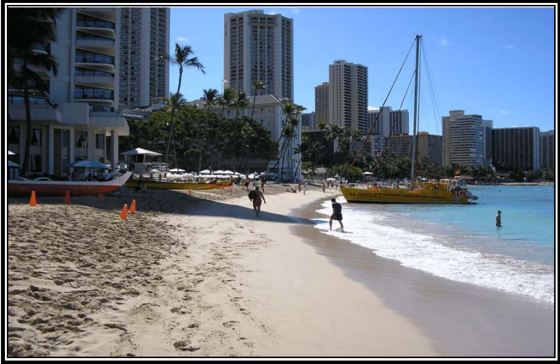
Gray's Beach 000159