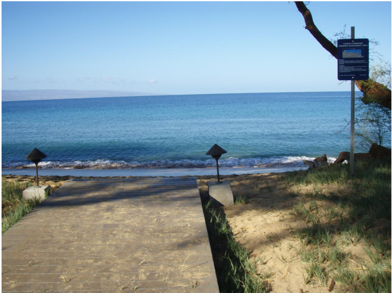
Sample site as seen from the beach board walk.

Comments: The sample site is located in the general area where submarine springs were reported to be located in the USGS Report 2009-5253 by Hunt and Rosa. The site is located north of the Westin Kaanapali Resort Villas.