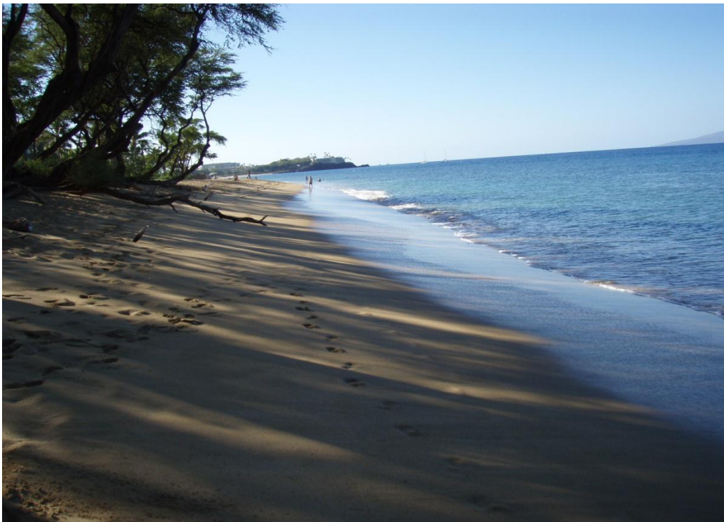
Looking south from the sample site.