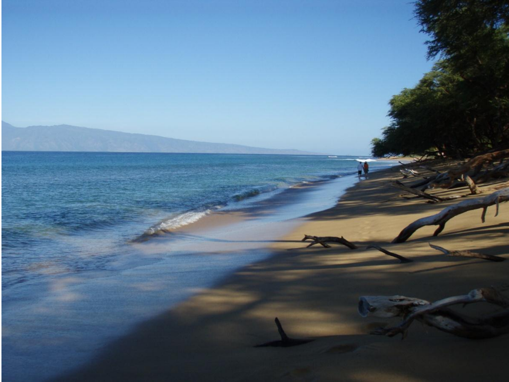
Looking north from the sample site.