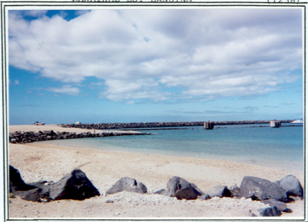
KAWAIHAE LST LANDING 1238